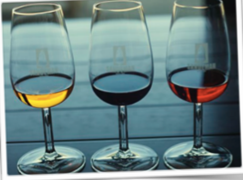
HPSO Galicia tour, March 2019